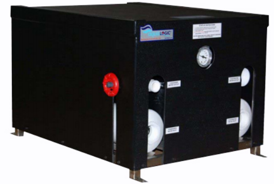
Chiller (Optional) Setups can be placed in walk in freezers and the chiller omitted.