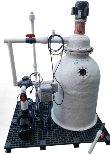
PBF Filter Skid