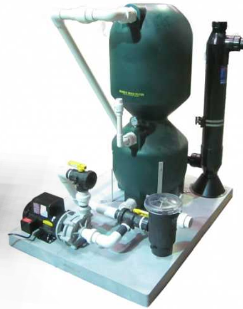
BBF Filter Skid